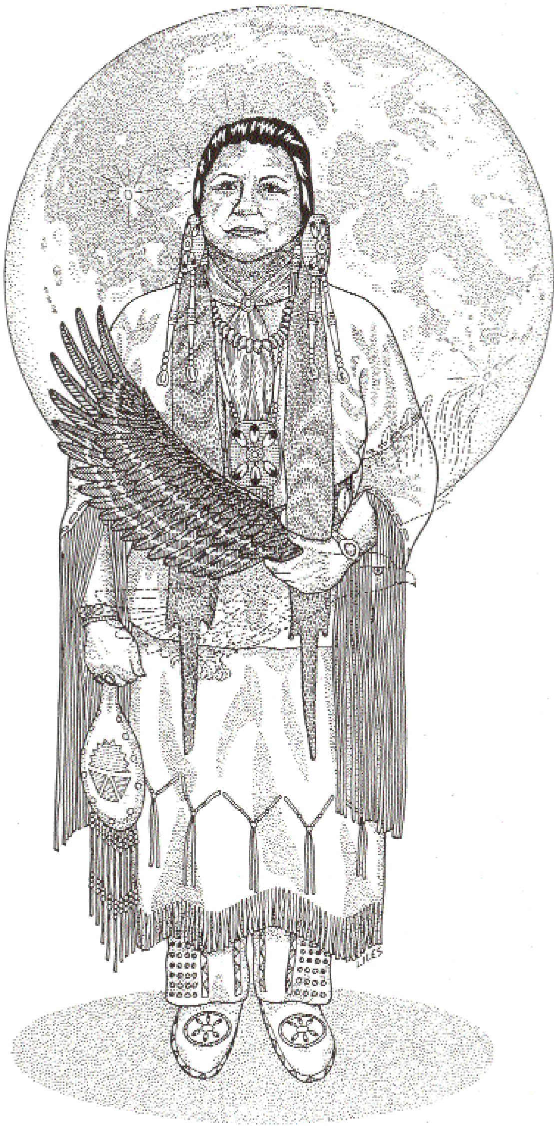
Women's Traditional Dancer