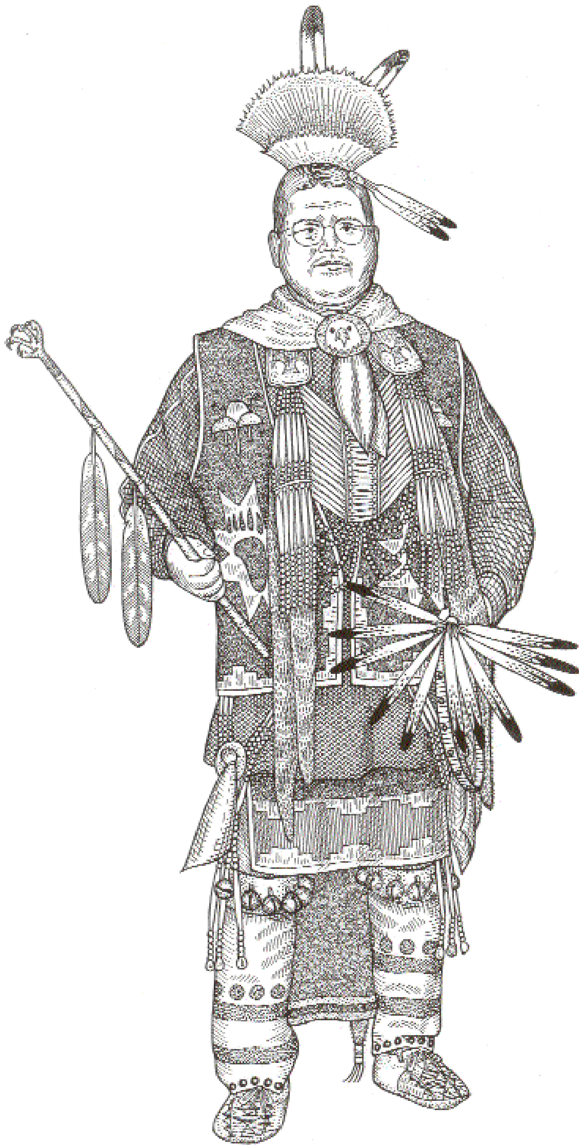
Men's Straight Dancer