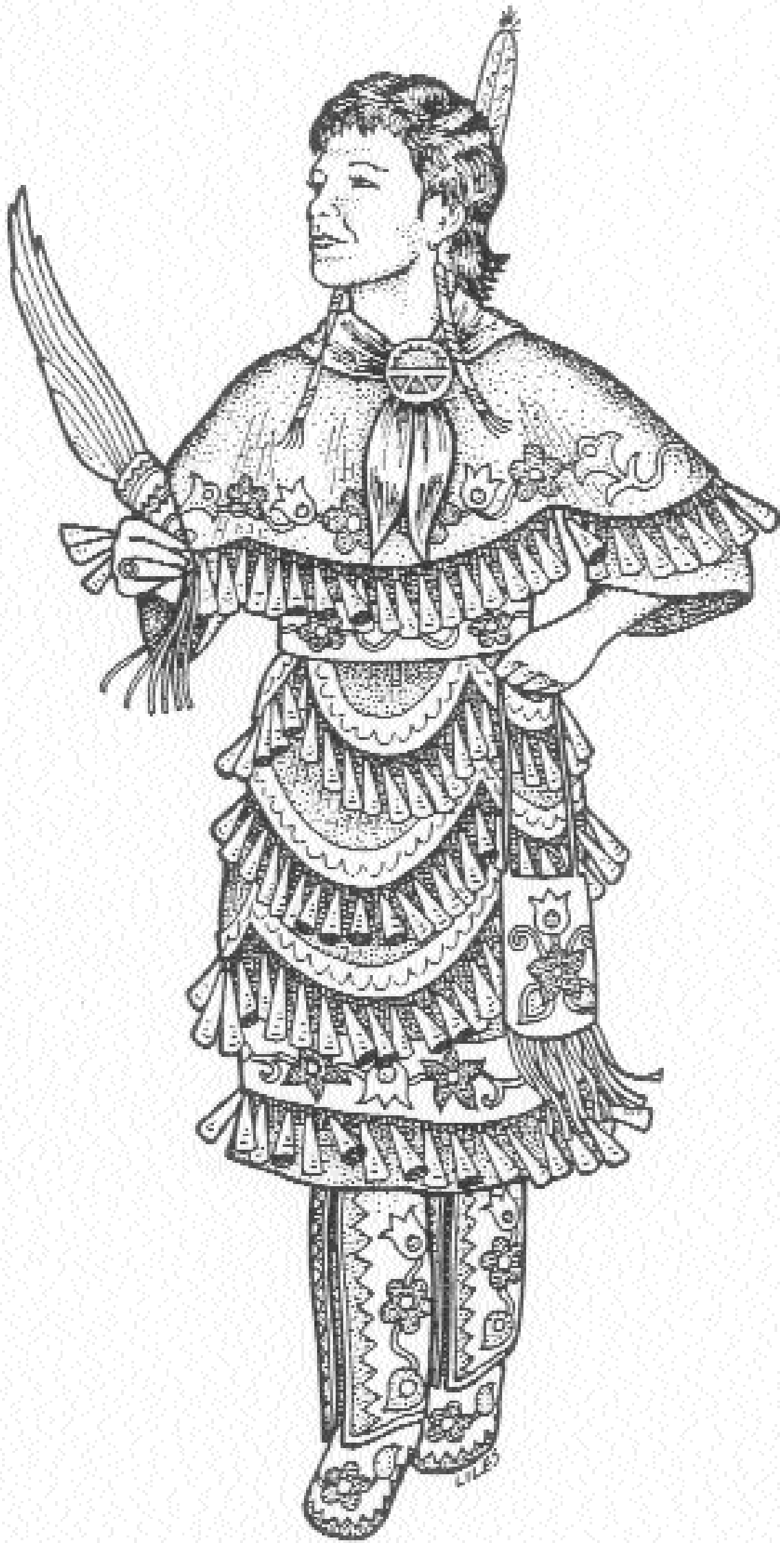
Women's Jingle Dress Dancer