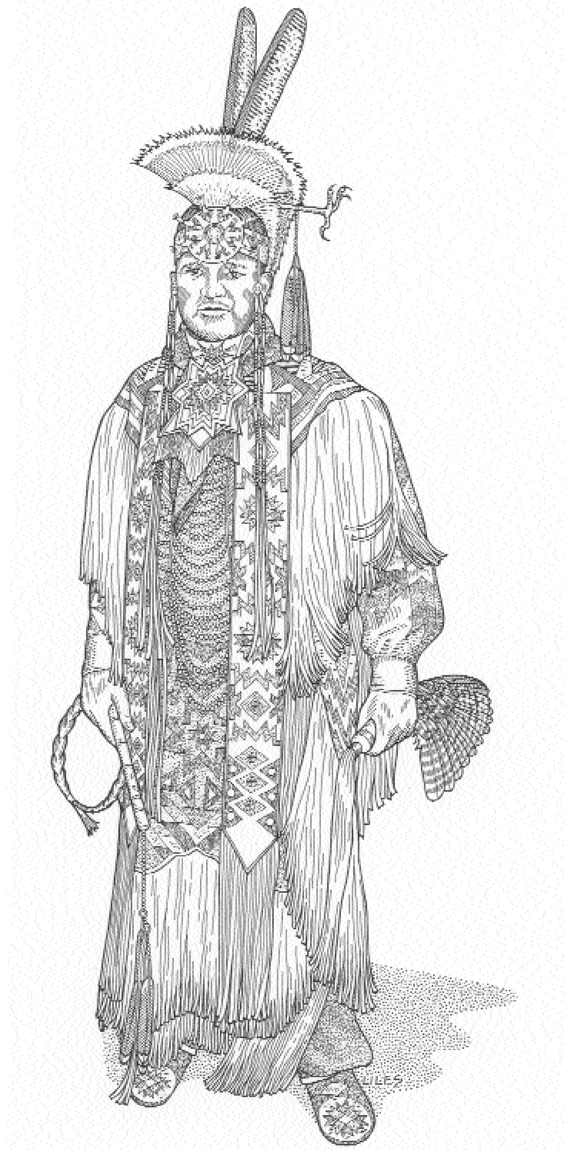
Men's Grass Dancer