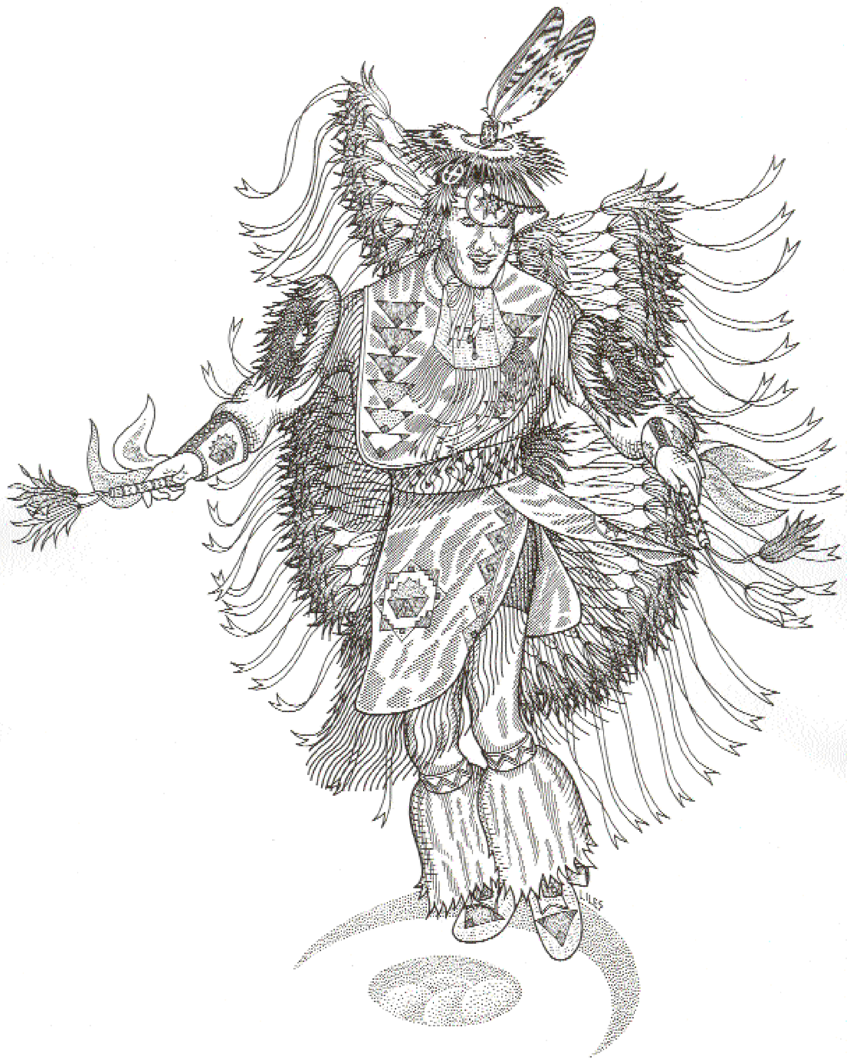
Men's Fancy Dancer