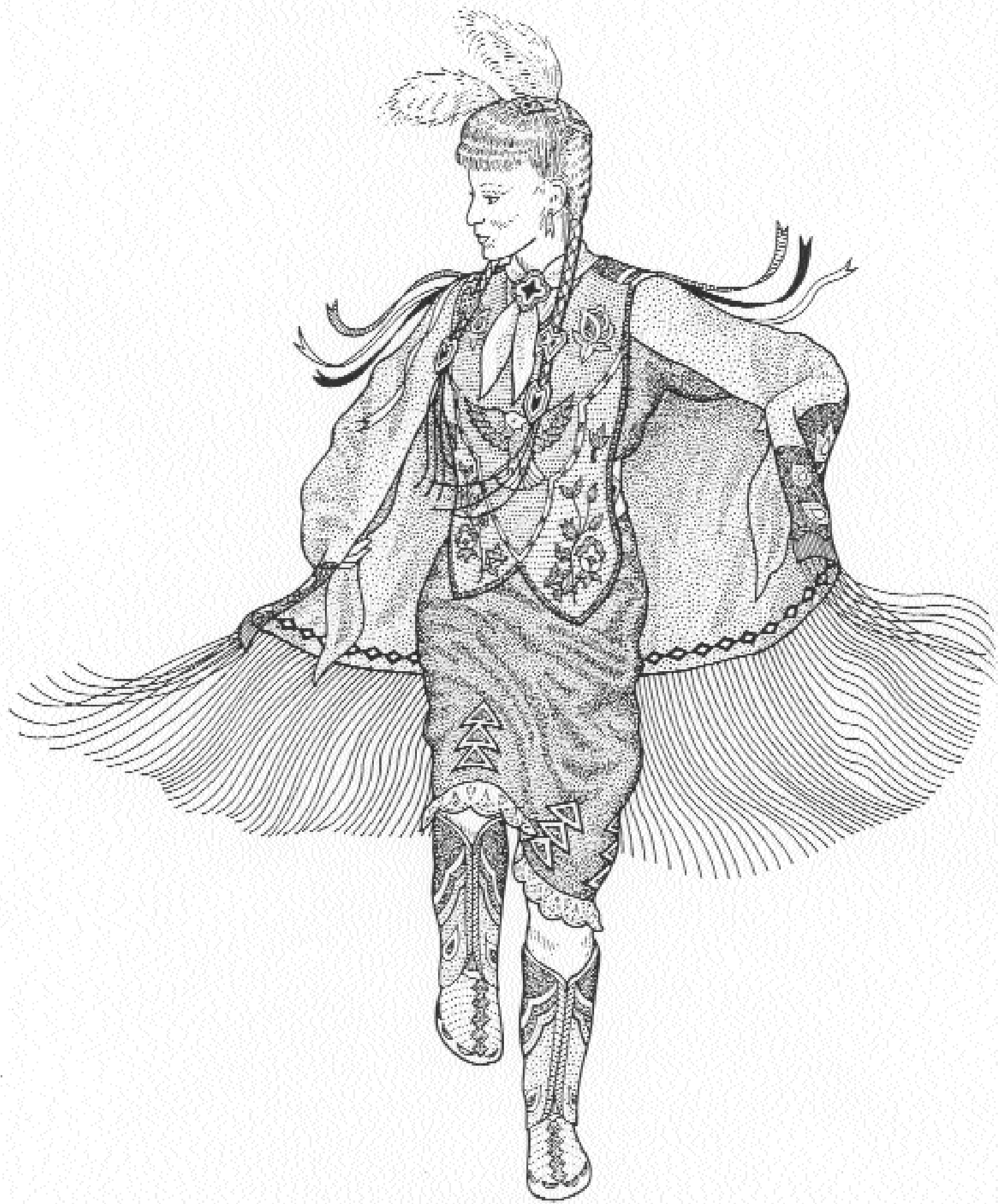
Women's Shawl Dancer