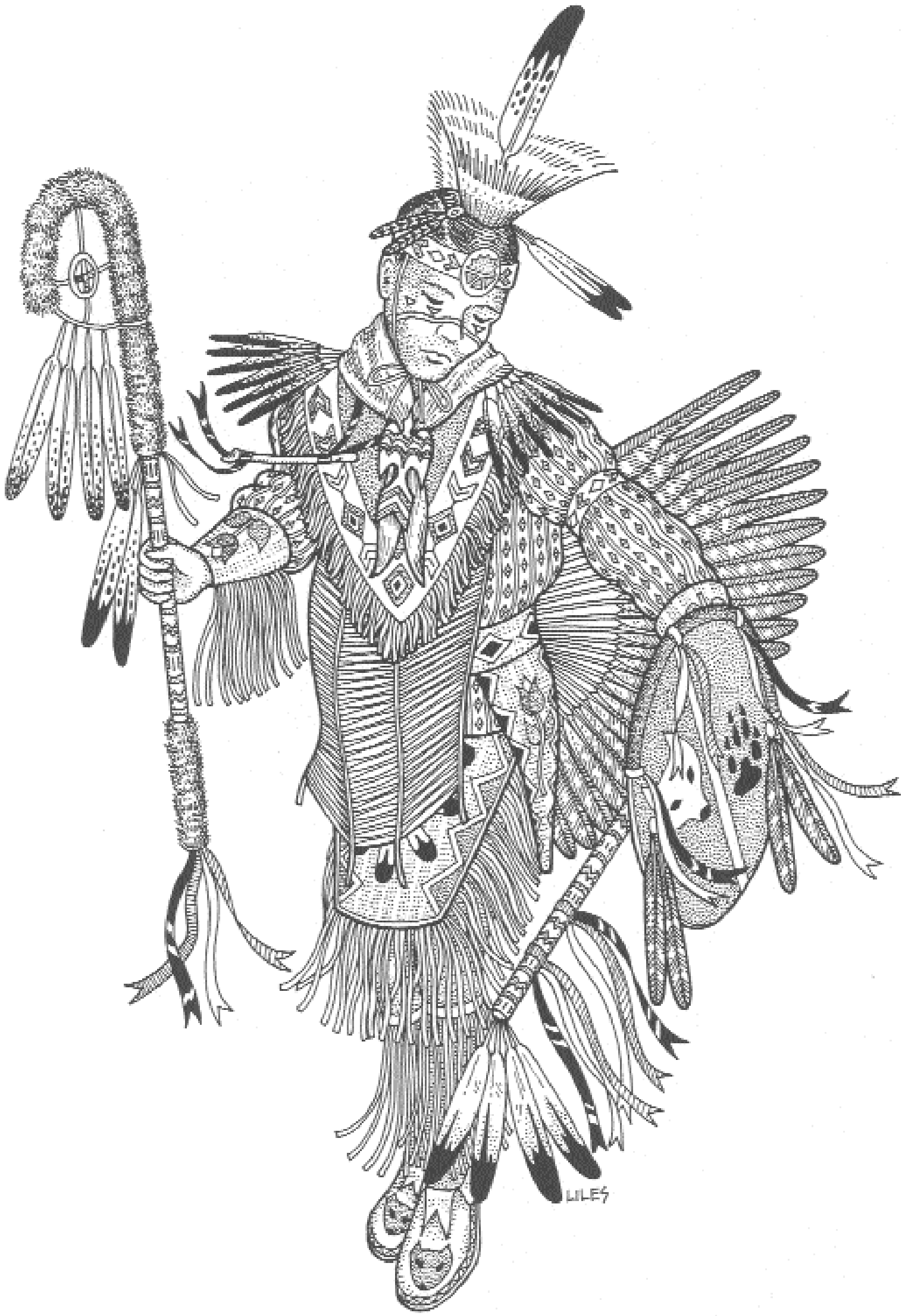
Men's Traditional Dancer