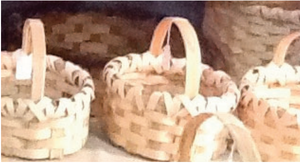
Neal Thomas oak baskets

For over 40 years Neal Thomas has woven sturdy handmade baskets out of white oak.